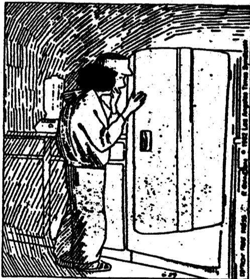
The carp diet. You place a carp in your refrigerator and it takes away your appetite.

Fort Lewis, Wash. .....The first record of a European widgeon was noted in December, feeding among two hundred American widgeon.....A record chum (dawg) salmon run occurred in January. Anticipating a large Rush of poachers from Oklahoma, the local University provided assistance. The Husky wardens, hiding in an Orange grove, swooped down on the Sooners, running and waving flags. Forewarned about Husky aerial attacks, they tried to escape in their Schooner wagon. The successful raid resulted in 28 citations issued for 17 dawgs in their possession. A federal judge in Reno deferred sentencing until the NMFWA meeting in March 1986..... A "Cookie Cutter", which is a unique channel cutting boat from Florida, has recently been used to open blocked salmon spawning areas and diversify wetland habitat.